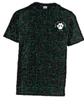
Gildan Youth Ultra Cotton® 6 oz. T-Shirt