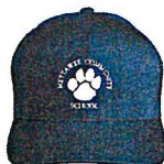
Team 365 By Yupoong Youth Zone Performance Cap