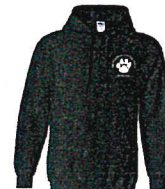
Gildan Heavy Blend Hooded Sweatshirt