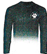
Badger Sport Ombre L/S Tee