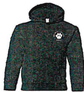
Gildan Youth Heavy Blend Hooded Sweatshirt