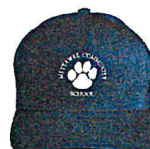
Team 365 By Yupoong Adult Zone Performance Cap