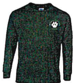
Gildan Adult Ultra Cotton 6 oz. Long-Sleeve T-Shirt