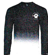
Badger Youth Ombre L/S Shirt