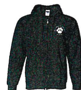
Gildan Adult Heavy Blend 8 oz., 50/50 Full-Zip Hood