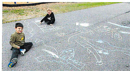
Chalkin' the walk on this beautiful Fall day!

October 28th & 29th - Preschool Conferences